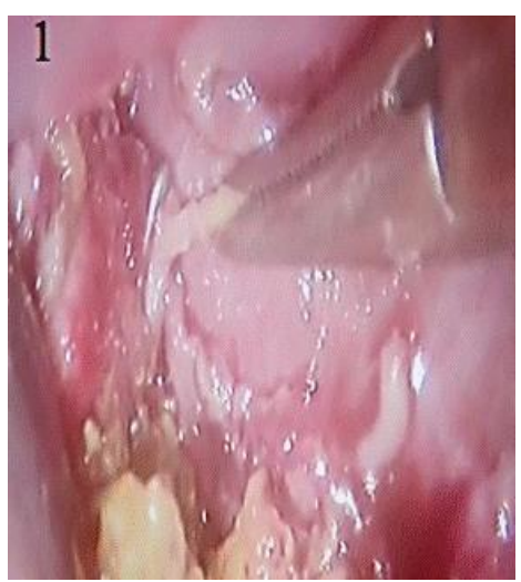
Figure 1 – Clip applied on the right hepatic duct in the hilum was identified at reintervention

located in the hepatic hilum on the right hepatic duct, proximal to those previously extracted also tangentially obstruction placed with approximately 50% of the duct (Figure 3 and 4). Taking into account the patient's age and longlife expectancy in order to avoid a debilitating surgery with a hepato-jejunal anastomosis in the hepatic hilum, it was chosen to place a stent in the right hepatic duct in hope of subsequent distension repermeabilization. and subsequent evolution was favorable with the remission of cytolysis syndrome. The patient was discharged 4 days after the procedure without symptoms. The 1-month revaluation by ultrasound did not identify any noticeable changes. TGO, TGP, GGT, and bilirubin also remained within normal limits.