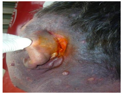
Figure 6 – Postoperative aspect

Given the overlapping of the two disorders, the surgical-medical approach of the ear damage has been insufficient in time due to the risk of hemorrhage, taking into account that the hemangioma was extended to the left external ear duct, pharynx and larynx. For this reason, the disease has progressed, leading to erosive extended cholesteatoma with left otomastoiditis.