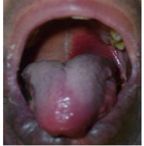
Figure 2 – Hemangioma extended to the oropharynx