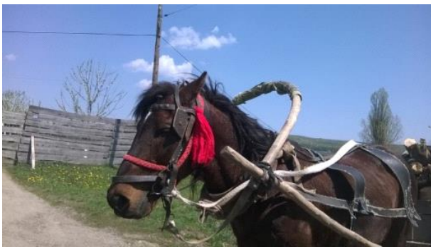
Figure 2 - Horse in harness with a shaft bow