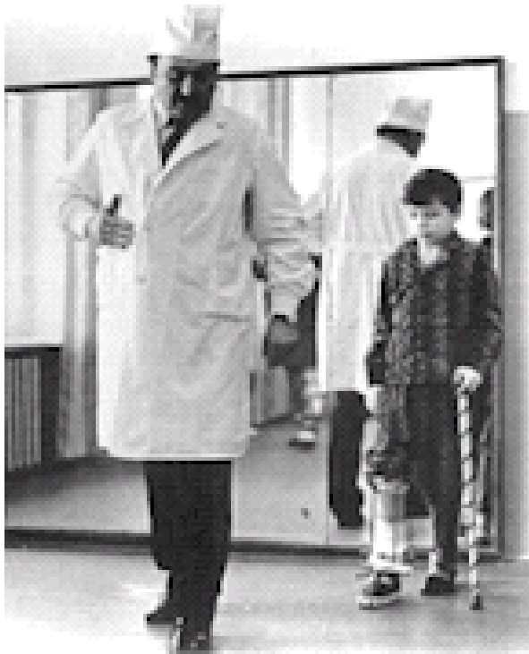
Figure 1 - Gavrill Ilizarov with a patient