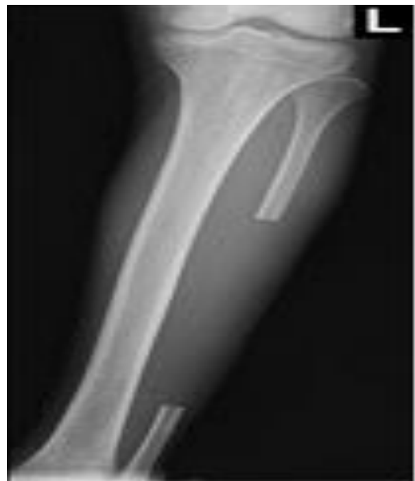
Figure 6 - Radiological aspect of the donor site