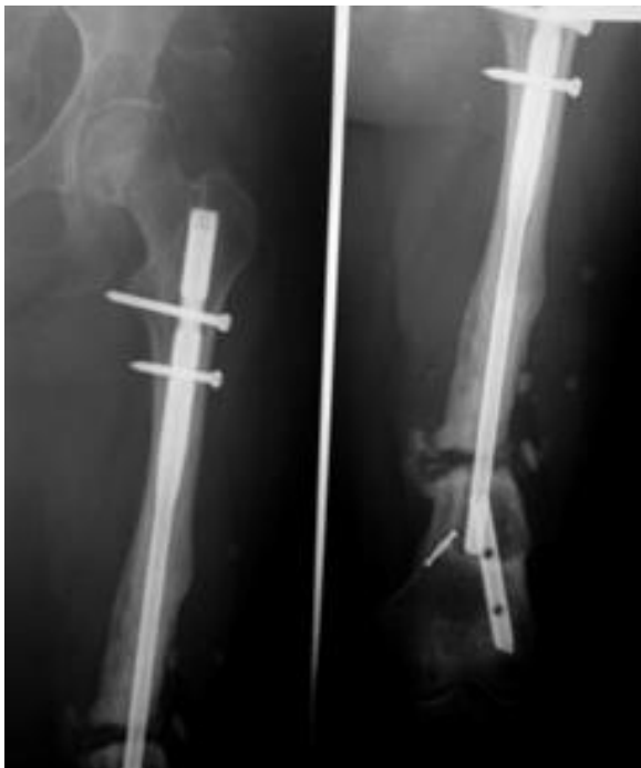
Figure 4 - AP view and lateral view of the affected femur showing implant failure

The postoperative aspect of the X-rays demonstrates that the fracture was poorly reduced with interfragmentary gap by malposition of the lag screw (Figure 2). After 9 months the patient developed atrophic non-union with axial deformity with a progressive negative clinical impact. After 1 year, the radiological examination highlights the appearance of irrigational callus and implant loosening. The clinical status of the patient got worse with intensive pain and loss of function in the lower limb (Figure 3). They decided to remove the DCS implant and they performed a revision surgical intervention using an intramedullary locked nail, autogenous bone graft and bone substitutes.