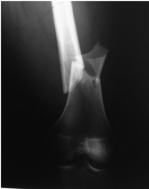
Figure 1 - AP projection of the right knee showing the distal third

The case of a 45-year-old overweight female which was the victim of a car accident in 2008 suffering a distal third femoral fracture classified by AO/OTA as 32-B2 (We present Figure 1). The fracture was surgically treated in another service by open reduction and internal fixation (ORIF) using a Dynamic Condylar Screw system (Figure 2,3)