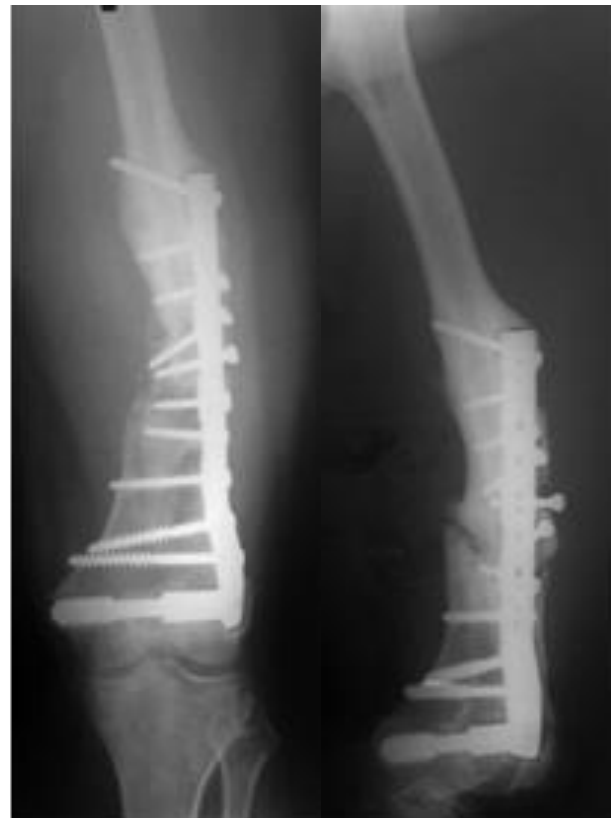
Figure 3 - Radiological aspect showing non-union and implant loosening. (A. A-P view; B. lateral view)

Examination highlights the appearance of irrigational callus and implant loosening. The clinical status of the patient got worse with intensive pain and loss of function in the lower limb (Figure 3). They decided to remove the DCS implant and they performed a revision surgical intervention using an intramedullary locked nail, autogenous bone graft and bone substitutes.