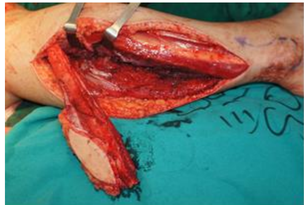
Figure 5 - The fibular graft just before the pedicle is transferred to the femoral area

Despite the large fibular defect, the donor site morbidity was negligible due to the fact that the middle third of the fibular is not involved in the biomechanical processes of the lower limb (Figure 6).