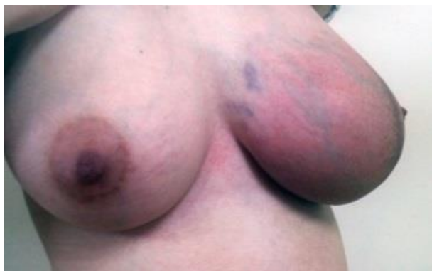
Figure 2. – Initial clinical examination

The breast ultrasound scan identified an extended tumor to all 4 quadrants of the breast, well delimited, with no adherence to tissue nearby (pectoral muscles or skin) with Doppler signal and without axillary lymphadenopathy. The contralateral breast scan showed normal parenchyma, without tumors or duct ectasia. The obstetrical ultrasound revealed in the uterine cavity a unique fetus, apparently normally conformed for 23 weeks 5 days. The hematological examination was in normal range, with a low pregnancy physiologic anemia. During the admission the patient underwent fine needle biopsy and core biopsy for the breast tumor. After the cytologic result (superficial