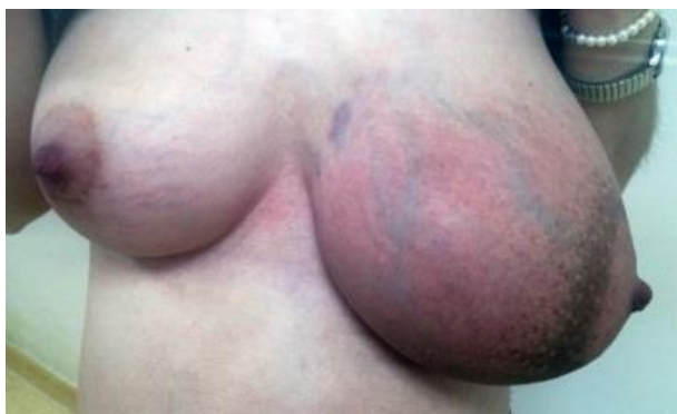
Figure 1 – Initial clinical examination

The clinical examination revealed the left breast transformed into a tumor, with its volume 2 times bigger than the right breast. The tumor was endured, poorly delimited, 7/6 cm, painless, with the blood vessels very well represented and the overlying skin of an orange-peel appearance. No axillary lymphadenopathy was found (Figures 1 and 2).