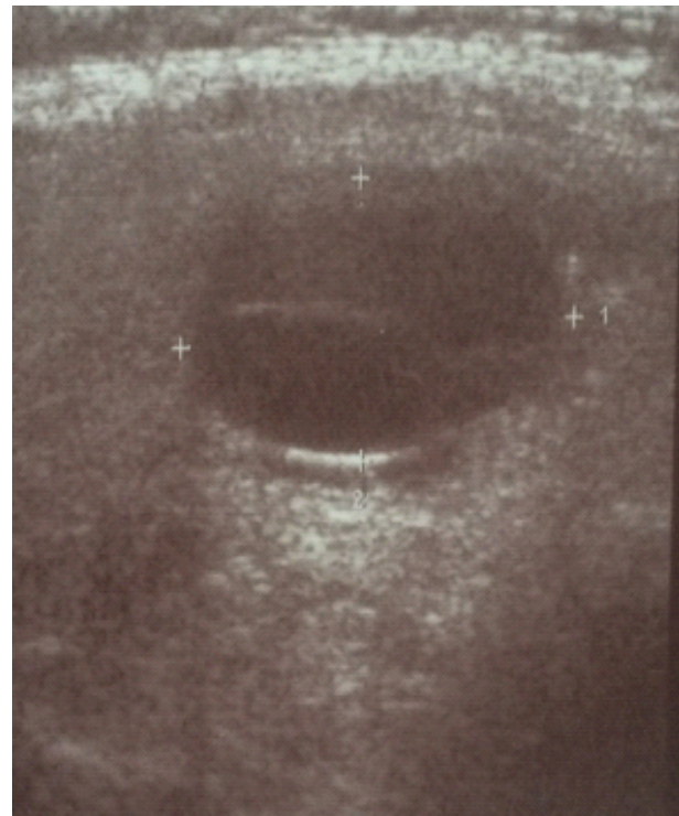
Figure 1B - Longitudinal section: hypoechoic nodule with posterior acoustic enhancement on the right thyroid lobe